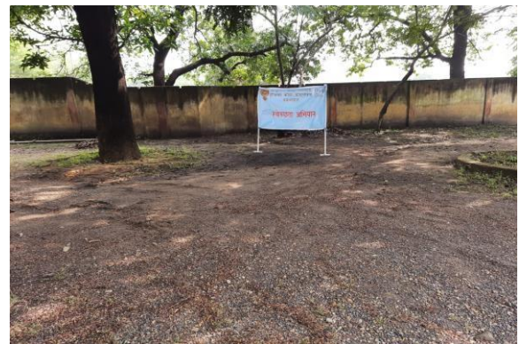
After Cleanliness Drive at Administrative Building in ICC