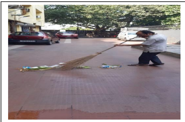
Cleanliness Drive of outside compound of CO, Kolkata