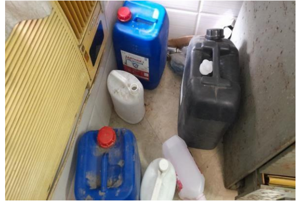
Before Cleanliness Drive in office at TCP Unit