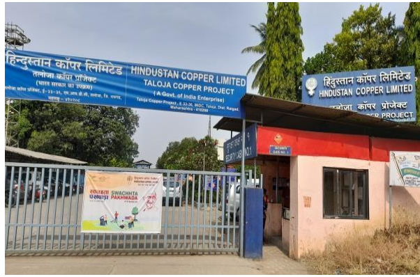
Swachhta Pakhwada, 2021 Banner was displayed at TCP/ HCL Gate