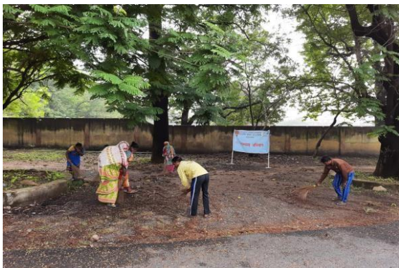
Cleanliness Drive at Administrative Building compound in ICC