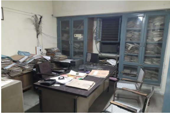
Before Cleanliness Drive in Office of KCC/ HCL