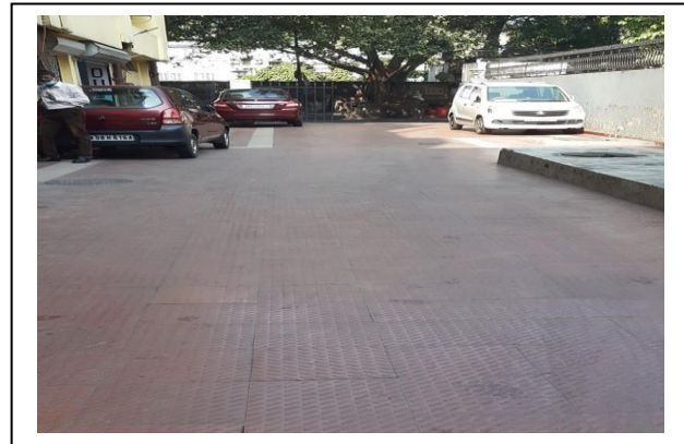
After Cleanliness Drive of outside compound of CO, Kolkata