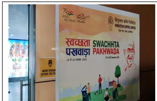
Swachhta Pakhwada, 2021 Banner was displayed at CO, Kolkata