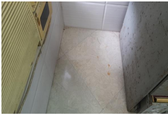
After Cleanliness Drive in office at TCP Unit