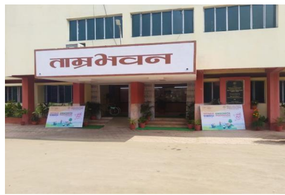
Banner was displayed at Tamra bhavan Office, MCP